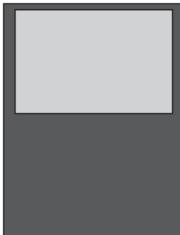
1/2 Page 7.375" x 4.875" Can be top or bottom of page.

Full Page including Bleed Coverage must extend to 8.625" x 11.125"